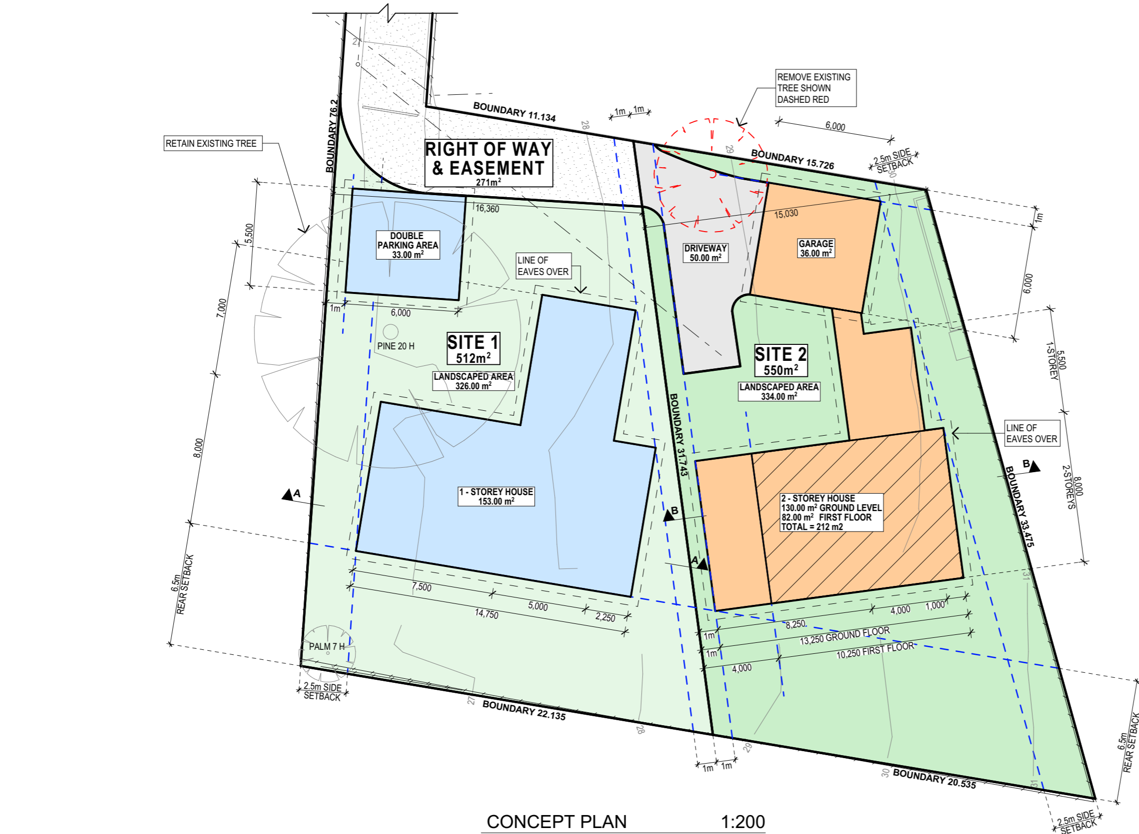
CONCEPT PLAN 1:200